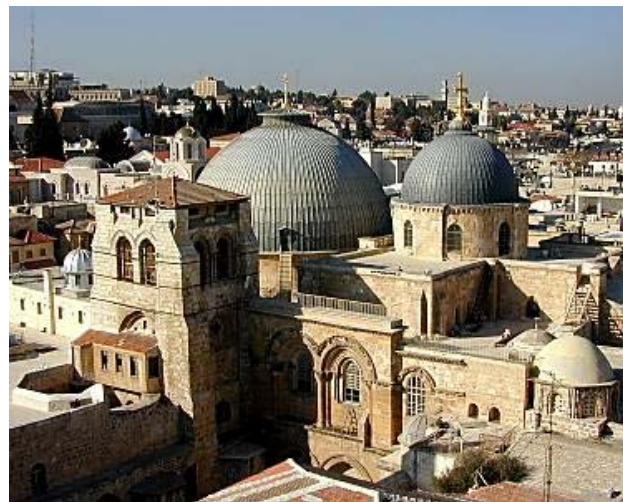
Holy Sepulchre Basilica, Jerusalem