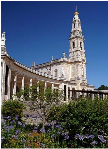
Our Lady of Fatima Basilica