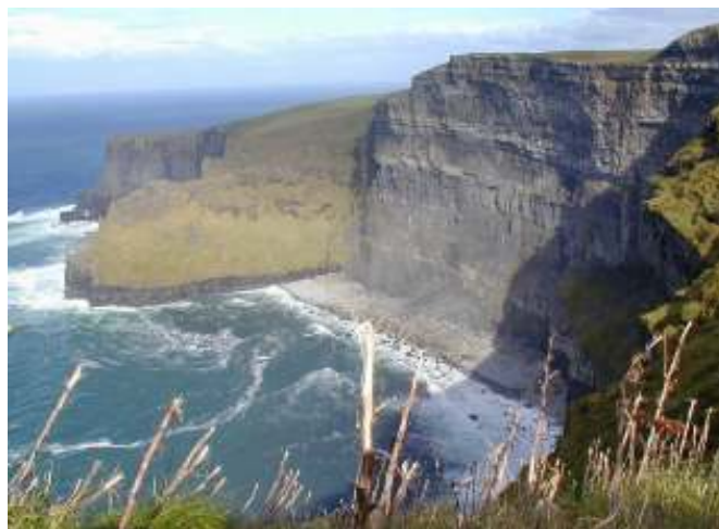
The Cliffs of Moher

Cost per person in twin flying from Jacksonville, FL: