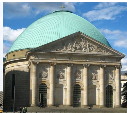
St. Hedwig Cathedral, Berlin (above) & Wawel Cathedral, Krakow (left)