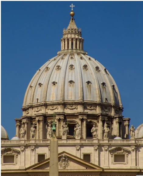
St. Peter Basilica, Rome