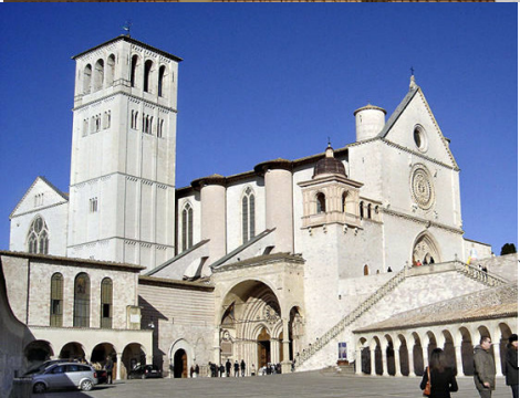
St. Francis Basilica, Assisi

**FORM OF PAYMENT FOR $500 NON-REFUNDABLE DEPOSIT Airline & hotels require non-refundable deposits next week to hold space for this once-in-a lifetime event. $500 per person payable by MC, Visa or Discover credit or debit card is due as soon as possible.