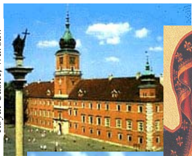
Royal Castle, Warsaw