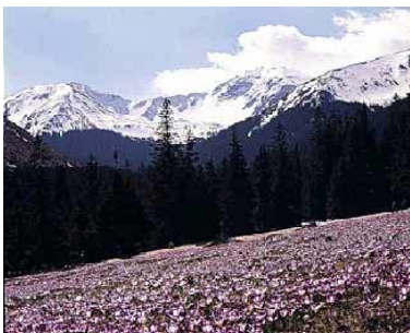
Zakopane lies at the foot of the Tatra Mountains

Depart southward through Polish countryside. Stop at the notorious Nazi concentration camp of Auschwitz , site where millions of victims were murdered during World War II. Visit the museum and pray with the Carmelite Sisters who live nearby and have dedicated their mission to praying for the souls of all who perished at Auschwitz. Visit Wadowice , the birthplace of Pope John Paul II. Enjoy lunch, then on to beautiful Krakow, a classic European city saved from destruction of Poland's many wars. (B,L)